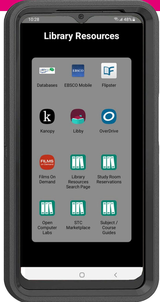
Library Resources Folder